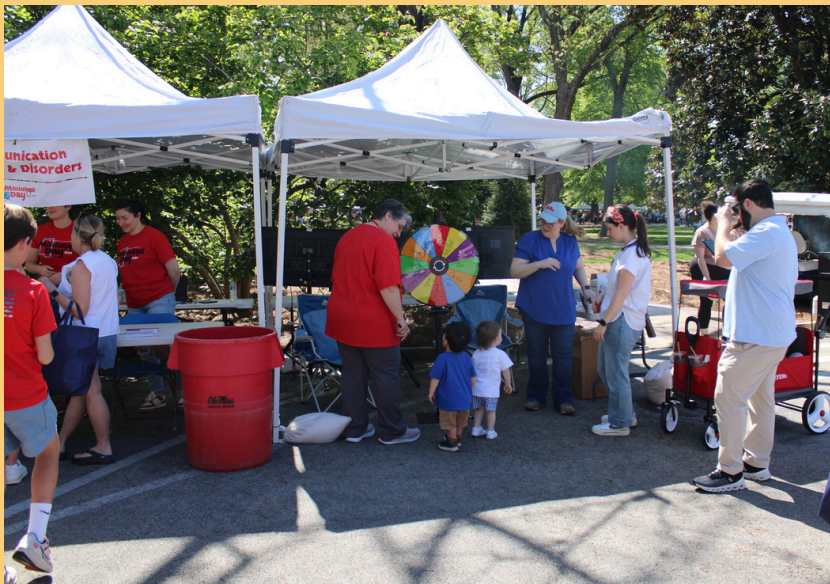
CSD Faculty and Staff participating in activities with community members.

Mississippi Day is a daylong celebration to highlight the university's achievements, programs, and services. The annual event launched in 2022 and gives future students and community a chance to see what Ole Miss has to offer. This day included hands on learning activities and games, along with food trucks and more. Here is a glimpse of what the CSD tent this year.