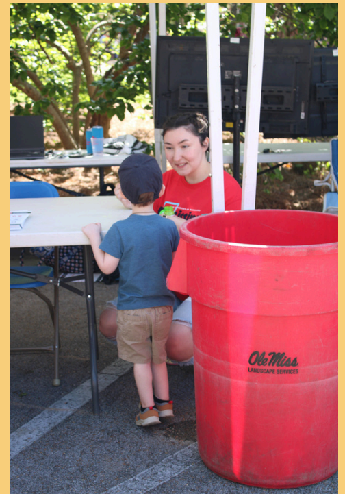
Graduate student engaging with child at tent.