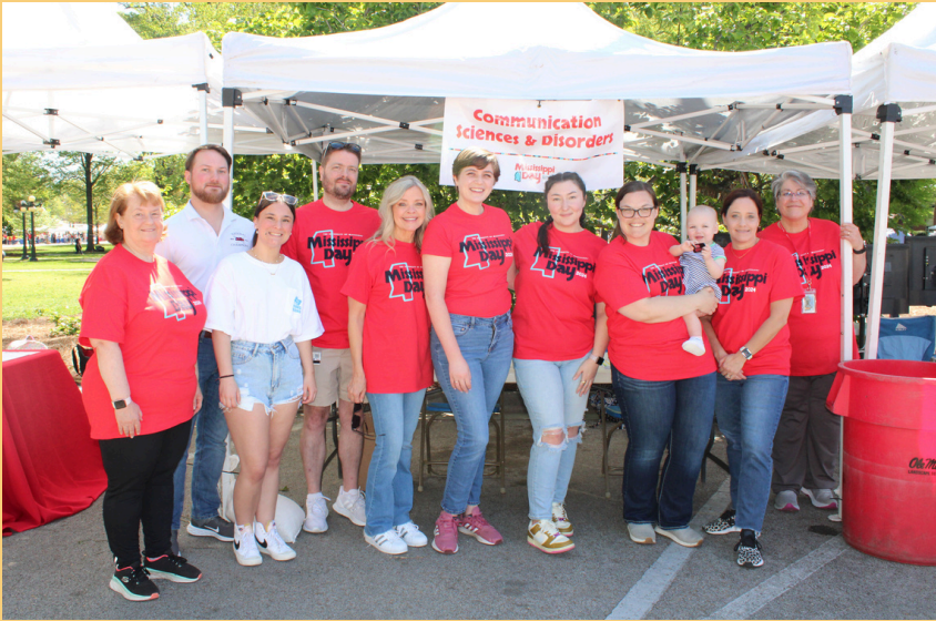
CSD representatives at tent for MS Day.