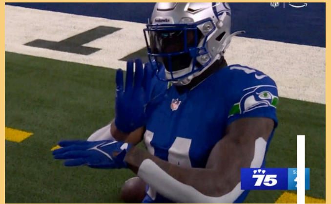
DK Metcalf seen using sign language during NFL game.